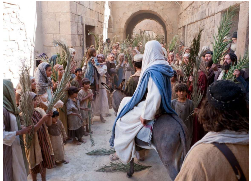
Jesus’ triumphal entry into Jerusalem